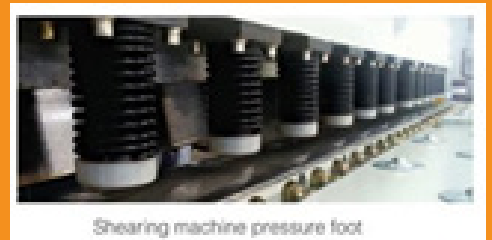
Shearing machine pressure foot