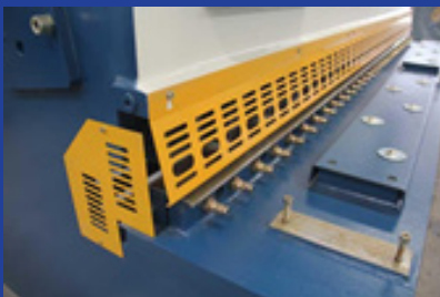
Protection guard at the front