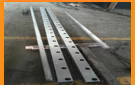
Punch and Multi-way Die K From China