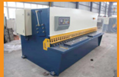
Protection guard and rolling material support ball