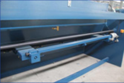
View from back