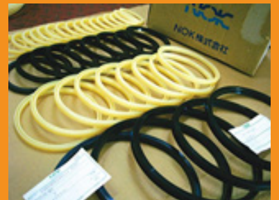
Sealing Ring NOK from Japan