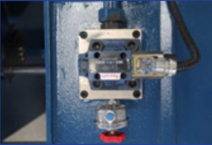
Hydraulic Valve Rexroth from Germany