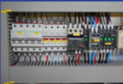
Electronic Parts Siemens from Germany