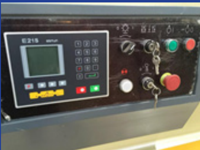
E21s NC SYSTEM ESTUN